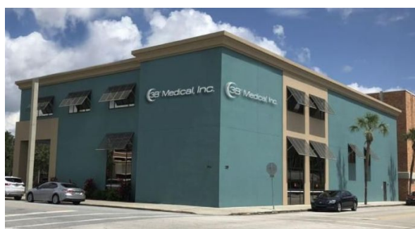
New Corporate Headquarters Winter Haven, Florida

This is just one of many exciting developments.