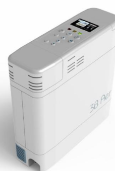
3B Aer - Portable Oxygen Concentrator 1Q19

The newest, lightest, smallest and most technologically advanced portable oxygen concentrator on the market with Bluetooth, 4G LTE Cellular, and the highest oxygen bolus on the market.